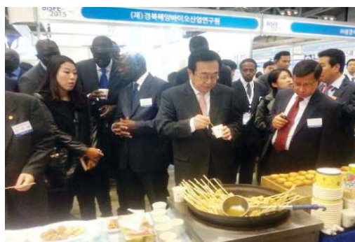
Bangladesh Ambassador alongside Busan Mayor Suh Byeong-soo visiting the fair at the opening ceremony of Expo

The Ambassador attended the opening ceremony of the event and joined the VIP luncheon following the ceremony. The Bangladesh booth was decorated with posters and banners of seafood and fisheries items and offered, posters, pamphlets, and brochures of Bangladesh's seafood and fisheries products and list of exporters to the visitors.